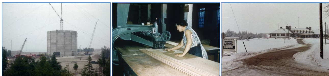
Douglas Point Nuclear Generating Station under construction 1961, A2007.060.009; Working inside Dominion Plywood, Southampton, 1950, A2013.035.013-007; Bruce Peninsula & Memorial Hospital, early 1970s, A2022.080.038