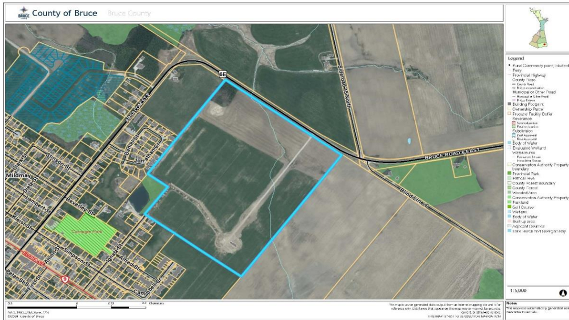
Figure 1 - Map of Property

A condition for Provisional Approval was for a 2.134 metre strip, being Part 4 on Plan 3R10817 (see Figure 2), to be conveyed to the County for road widening purposes, and that the applicant's solicitor provide an acknowledgement and direction and an undertaking to register the road widening at the time of registration of the certified consent to the satisfaction of the County.