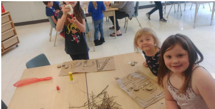
St. Edmunds School Visit