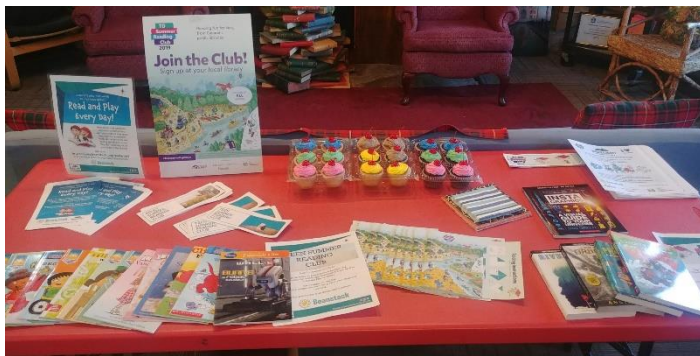
Summer Reading Club Kick Off