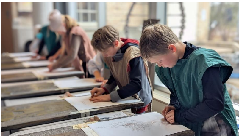
Students work on brass rubbings during Ancient Civilizations

In April the Museum delivered 11 days of Museum education programs to 367 students. Programs included LEGO® Design Challenges, LEGO Printmaking, and for the first time since 2019, the In-Museum Ancient Civilizations program. Students enjoyed a full day of immersive, hands-on learning at 6 activity stations featuring Medieval Europe, Ancient Greece, Ancient Maya, and the Silk Road.