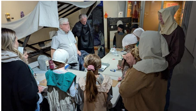
Students learning about the role of the blacksmith in Medieval Europe

On April 22, the 2025 Earth Week Digital Program “Our Power, Our Planet” , presented in partnership with Bruce Power, launched on the Museum’s Digital Education Centre. This program teaches about energy, renewable and non-renewable sources of energy, their effects on the climate, and sustainable practices through presentations prepared by guest experts. Each video is accompanied by a challenge/activity that students and families can try in the classroom or at home. Contributors include The Lake Huron Coastal Centre, The NII, and Grey Sauble Conservation. This year a Jeopardy-style digital game is also available to test your energy knowledge. Earth Week 2025 connects to the Conservation of Energy and Resources strand of Ontario’s Grade 5 Science and Technology curriculum.