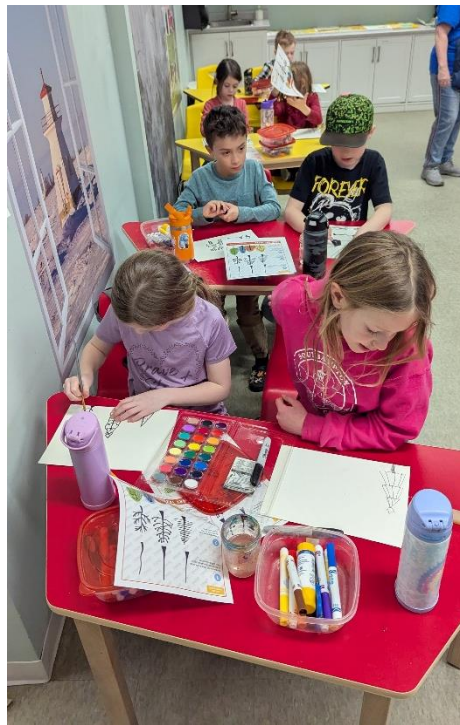
Children trying out watercolour techniques during Make it Painted