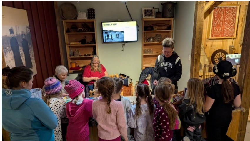
March Break Explorers watching a yarn spinning demonstration in the Last Frontier Exhibit

This sold-out camp was a fantastic week of fun and learning for everyone. 15 kids ages 5 to 10 spent their days in the exhibits, doing crafts, games, experiments, outdoor play and seeing special guest presentations in the theatre. Daily themes included Illusions, A Splash of Inspiration, Animal Planet, Legends and Lore, and Space Academy.