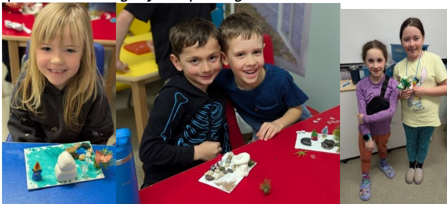
Kids show off their gnome gardens and lunar landers designed during Explorers Camp