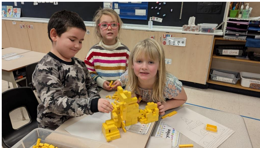
Kindergarten students work together to build a LEGO® tower.

In January, the Museum delivered 2 days of Mobile Museum education programs to 96 students. Programs included LEGO® Design Challenges for Kindergarten classes, and a day of Ancient Civilizations Programming for grades 3-5. Two additional programs were postponed to the spring due to bus cancellations.