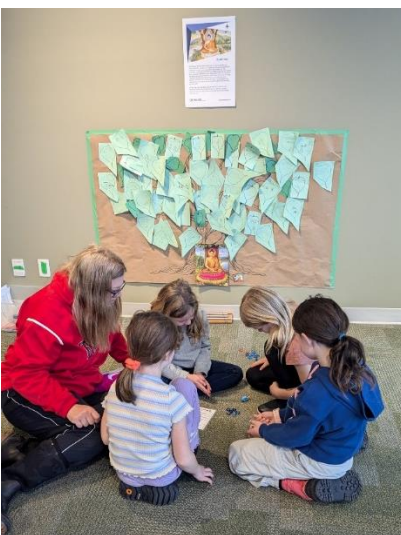
Grade 2 students from Arran Tara play a dreidel game.

In December, the Museum provided education programs for 197 students during 5 days of programming including 2 days of Mobile Museum Programs. A popular program at this time of year is the Winter Celebrations program for grade 2 classes, which is tied to the social studies curriculum. Participants hear a solstice story, play dreidel for Hanukkah, dance to Bollywood music for Diwali, do a Bohdi Day meditation, and make Christmas pomanders.