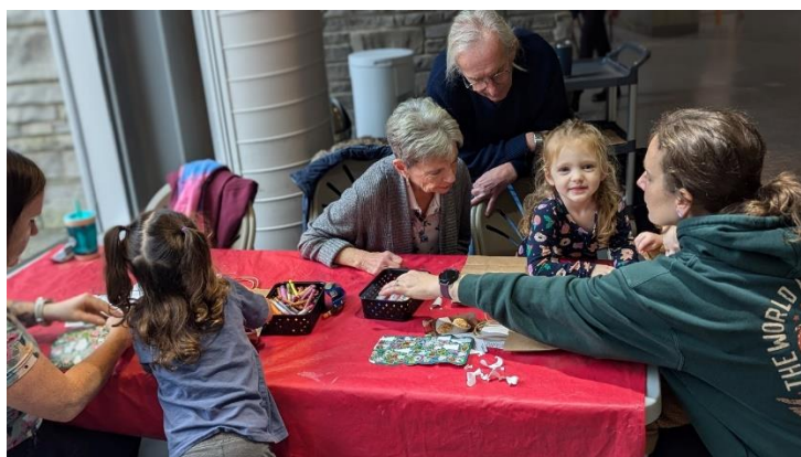
Museum Munchkins decorating Meal Kit Bags to be donated to Saugeen First Nation Food Bank