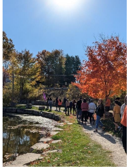
Walk for Wenjack in Southampton on October 21