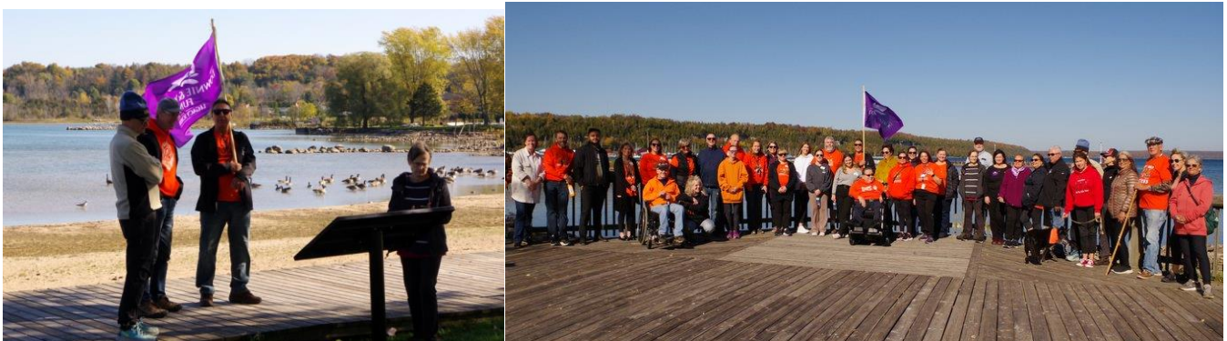
Walk for Wenjack in Wiarton on October 18

The Museum also hosted 3 screenings of The Secret Path. The Secret Path is an animated film adaptation of Gord Downie's album and Jeff Lemire's graphic novel. Working with Downie's poetry and music, Lemire has created a powerful visual representation of the life of Chanie Wenjack. Over 150 visitors took part in the screenings.