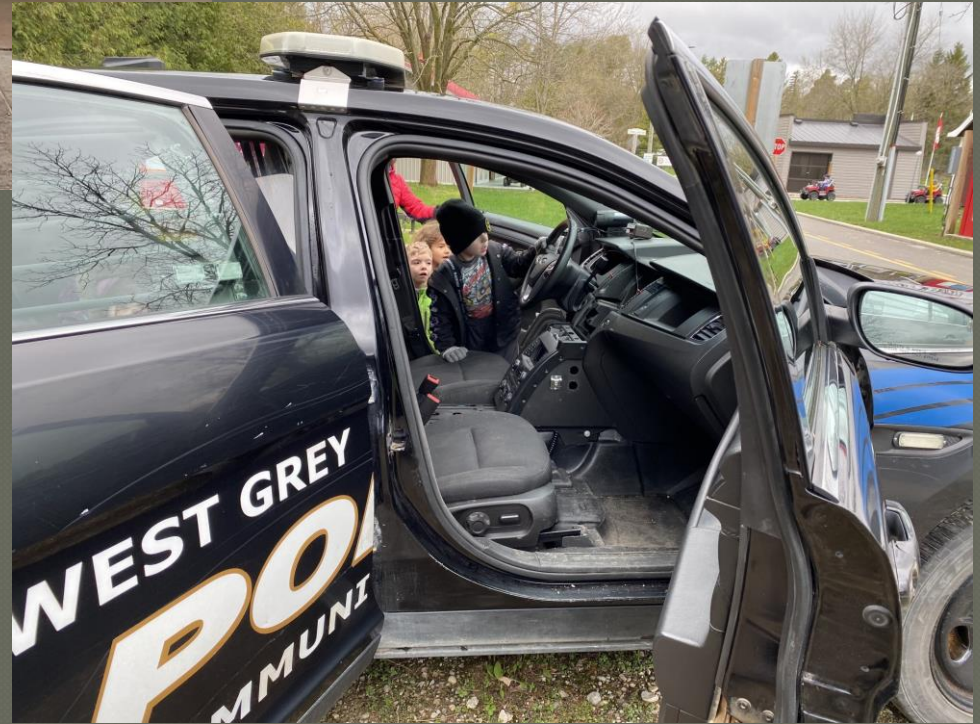
Donated West Grey Police Services vehicle.