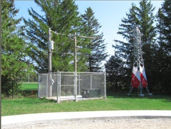
Hydro 1 & Westario