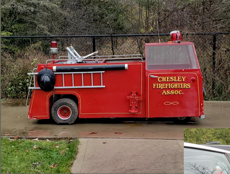
Donated mini-fire truck.