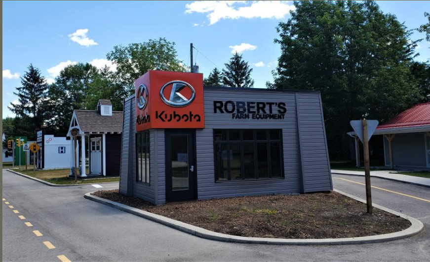
Farm Equipment Dealership