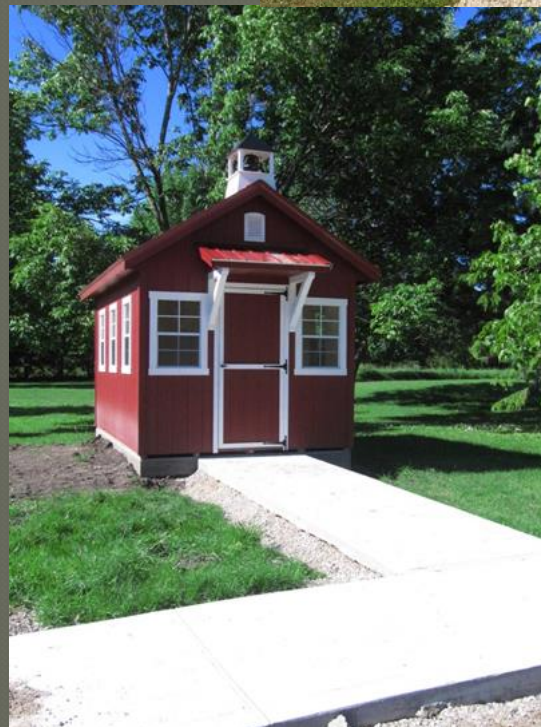
Eva LeFlar Schoolhouse