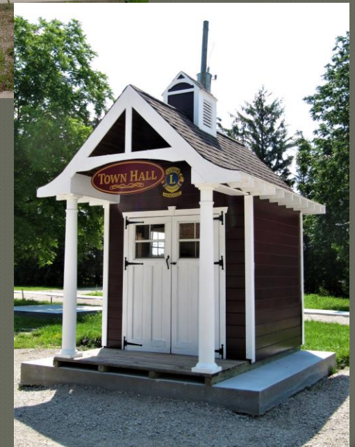
Hanover Lions Town Hall