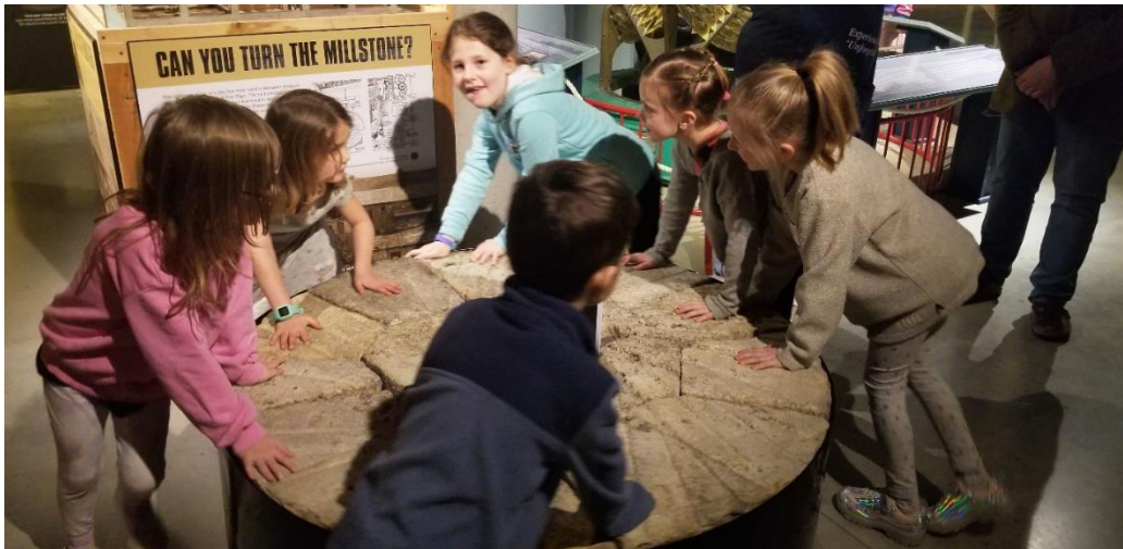
Students attempt to turn the millstone in The Last Frontier exhibit.

The Museum delivered 9 education programs over three days in February, reaching 106 students. Popular programs included: Anishnaabwe Endaat and A Day in the Life of a Pioneer Child.