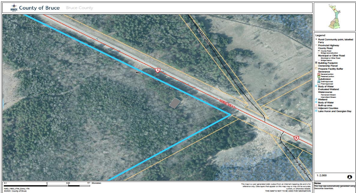
Figure 2 - Location of Shop

The Central Peninsula Sno-Drifters Snowmobile Club was a key partner during the planning and construction phase of the building by providing in-kind and funding support. In exchange, the county has provided the club with a dedicated space to hold club meetings and store equipment. The arrangement has been beneficial to both the county and the club, but there was a need to improve the terms and conditions of the relationship by including a lease agreement and adequate insurance coverage to use the facility.