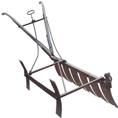
Ice Plow featured in Ice Harvesting story.