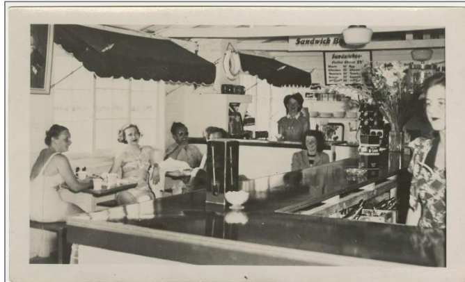
Bluewater Tea Room, Port Elgin, 1947, A2023.069.019