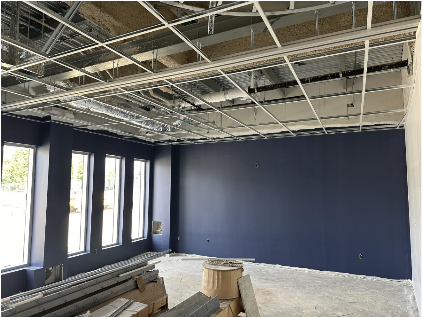
Front meeting room, T-bar ceilings are being installed on the north side of the building.