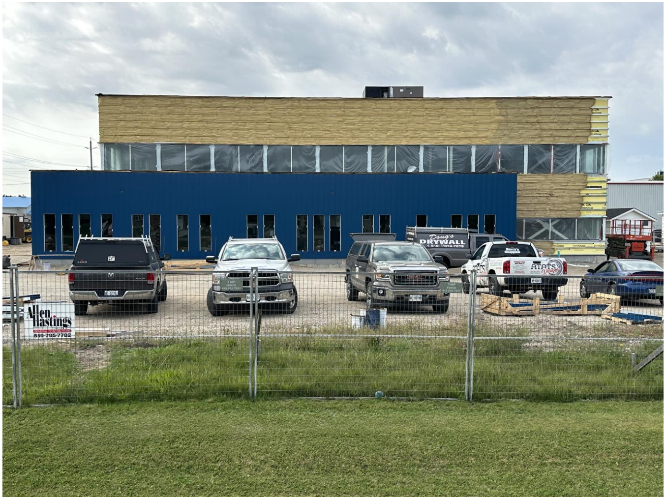
Blue Heron siding panels on north and east side almost complete, waiting on delivery of the aluminum panels white, charcoal and yellow.