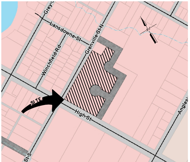
TOWN OF SAUGUEN SHORES KEY PLAN NOT TO SCALE