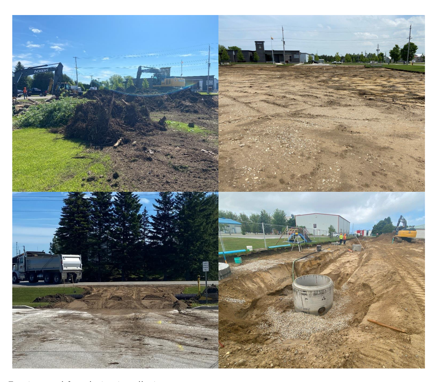
Footings and foundation installations