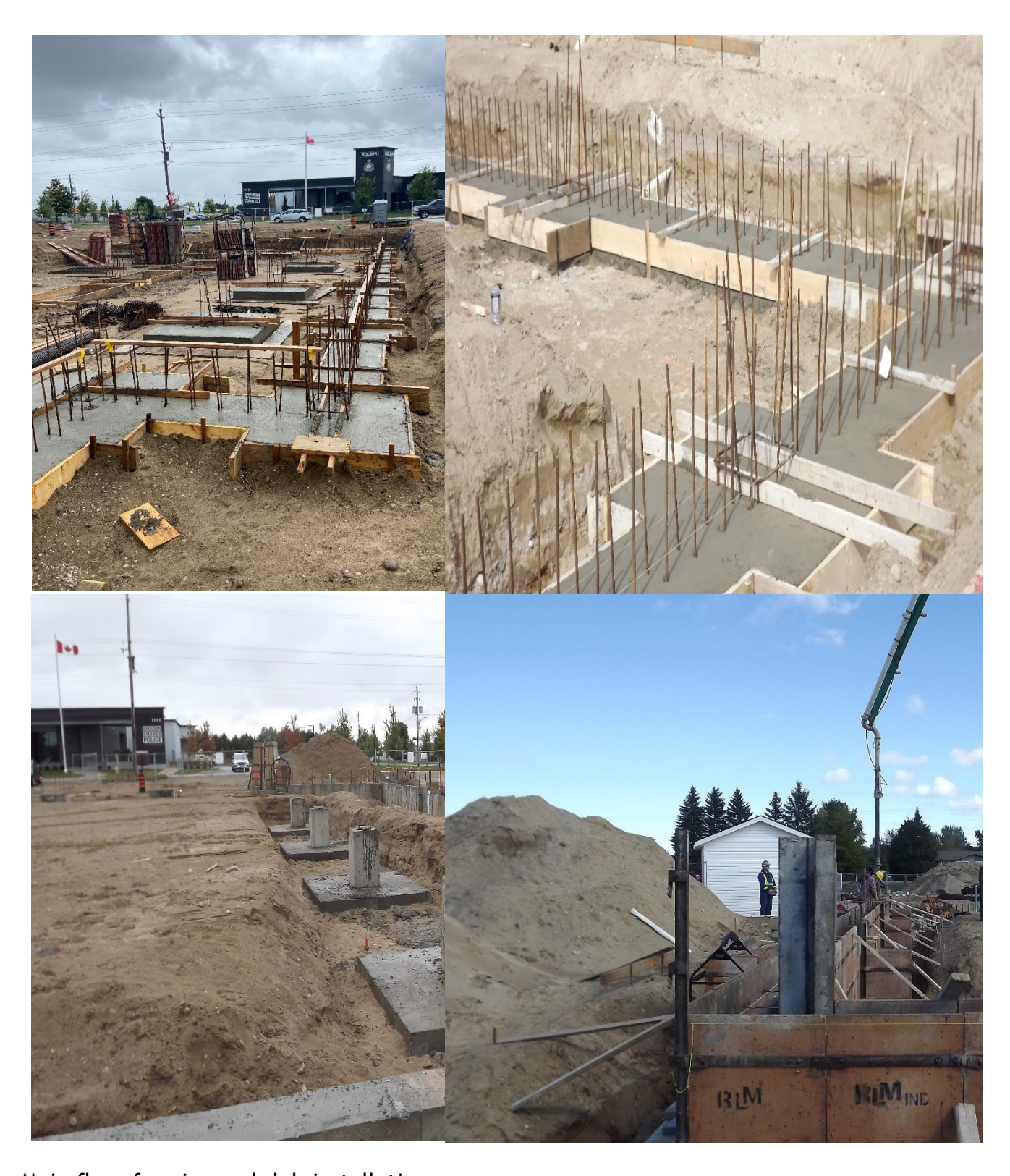
Main floor forming and slab installation.