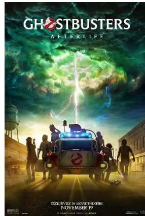
Movie posters for “The Addams Family” (2020) and “Ghostbusters: Afterlife” (2021)