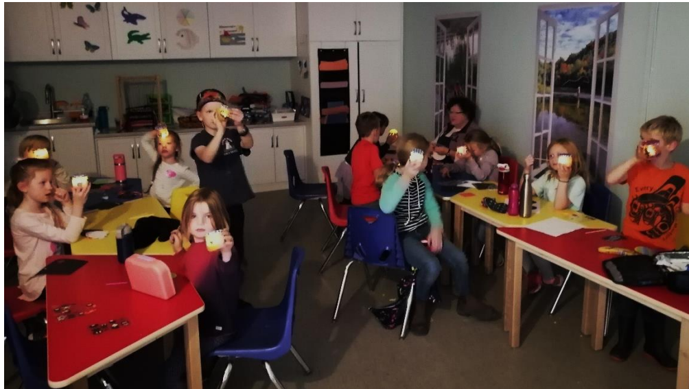
PA Day Maker Day participants holding up their Halloween lantern creations in the dark

Children ages 5-10 enjoyed a full day playing ghoulish games and making creepy creations. Using everyday craft supplies, participants created their own colorful slime, working lanterns, and frightful art. The kids were able to do a behind the scenes scavenger hunt in our historic log buildings, searching out spiders, cats, and bats (oh my!). In addition, the kids had time to explore the museum, hike around Fairy Lake, and spend time at the park. The Maker Day was sold out with 15 program participants.