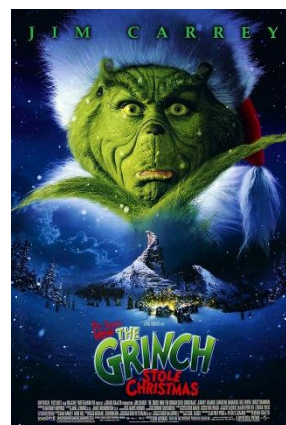
Movie posters for "Minions: The Rise of Gru" (2022) & "How the Grinch Stole Christmas" (2000)