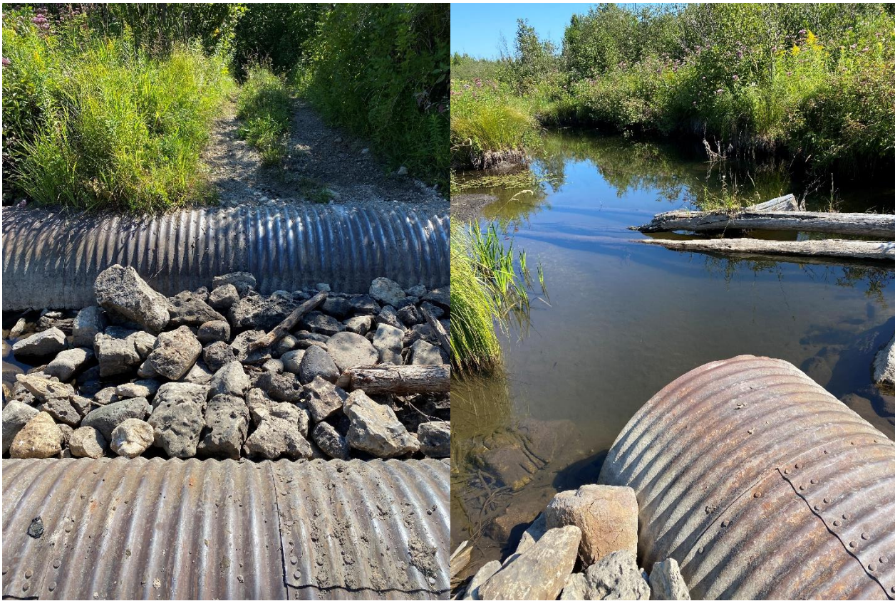
Photos of the Existing Culvert looking west along the road, and north into Silver Creek