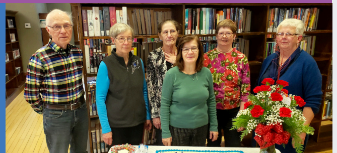
The Port Elgin Friends celebrated the branch's 111th birthday

Chesley Friends of the Library Lion's Head Friends of the Library Port Elgin Friends of the Library Tobermory Friends of the Library Warton Friends of the Library